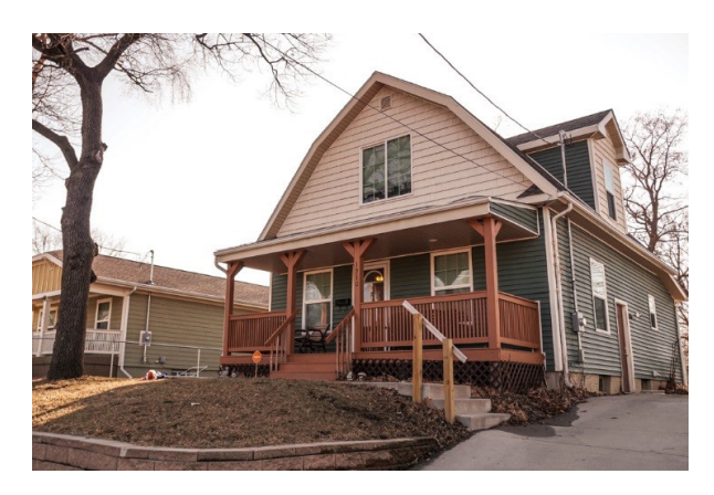
GDM Habitat Rehabilitation

Many residents of Greater Des Moines struggle with a lack of affordable housing. In Polk County alone, more than 25,000 working families do not earn enough to qualify for a traditional mortgage.