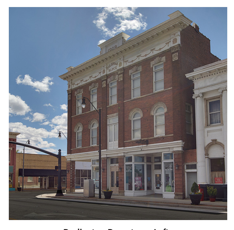
Darlington Downtown Lofts