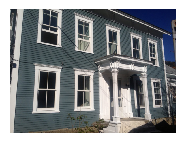
Mountain View Apartments

2015 marked the 25th anniversary of the Addison County Community Trust (ACCT) providing affordable housing to residents of Addison County, Vermont.